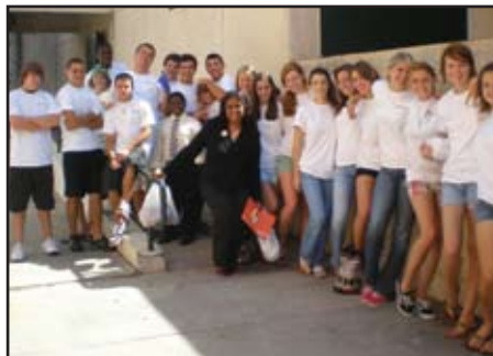
Students from Shorecrest Preparatory School volunteered as servers.