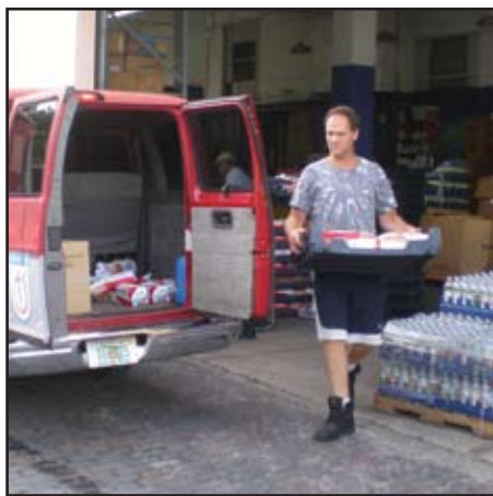
Volunteers load Sara Lee bread onto the vehicles of our partner agencies on Tuesday mornings.